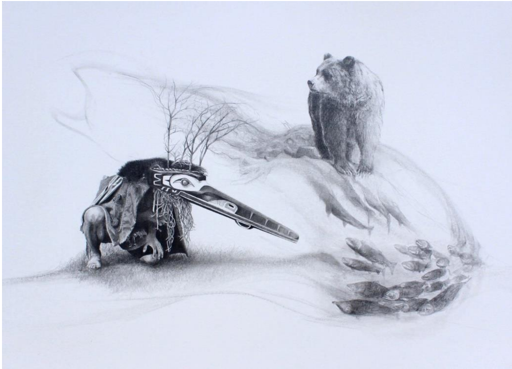
"Calling the Salmon Home"