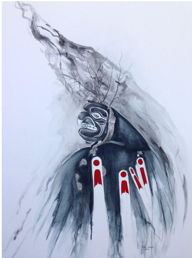
“The Power of Thunder”